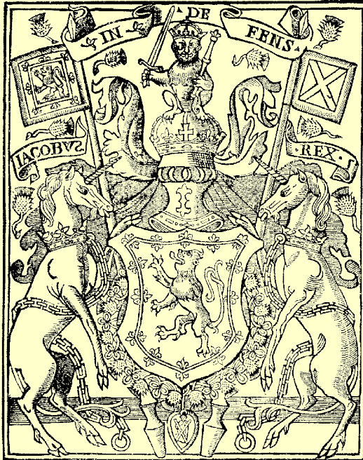
Title page from Bellenden's Chroniklis... [1542] from: Dickson/Edmond, Annals of Scottish Printing... (reduced)